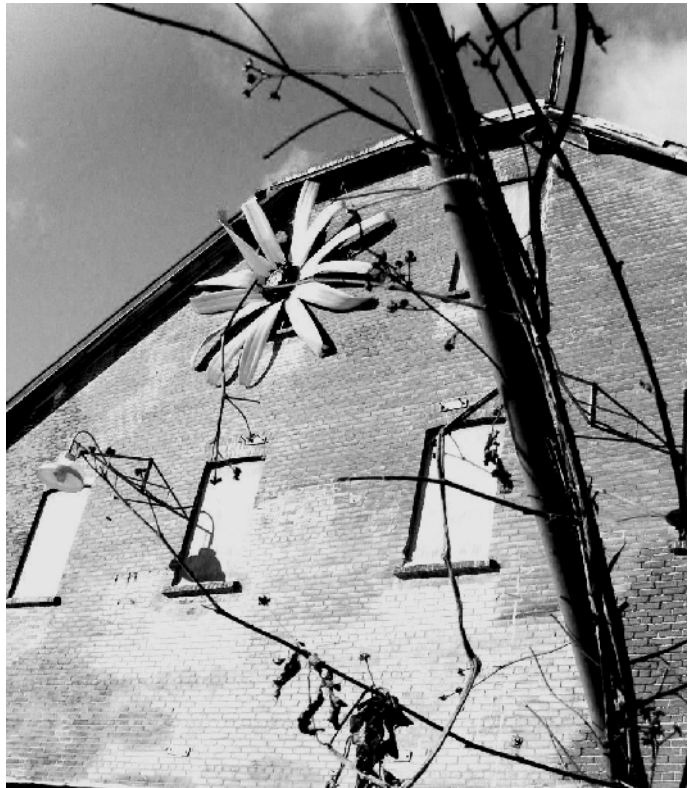
The Brickworks Toronto A Great Place to visit. History, Art, Ice Skating, Geology and Gourmet Hot Chocolate